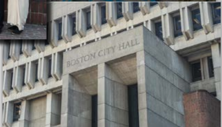
Right: Indian flag raised above Boston City Hall

We Would Appreciate Your Feedback Please Send Your Response To :