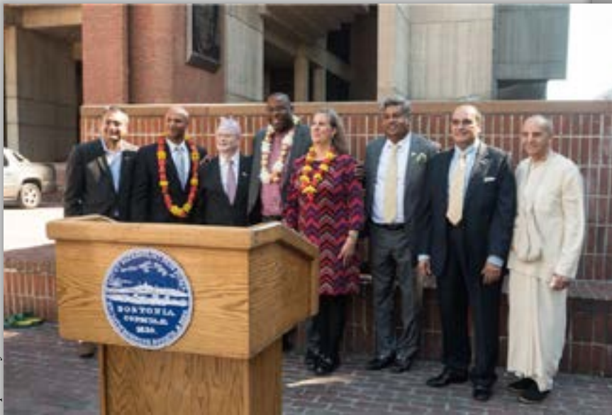
Above: Honorees and special guests of the flag ceremony