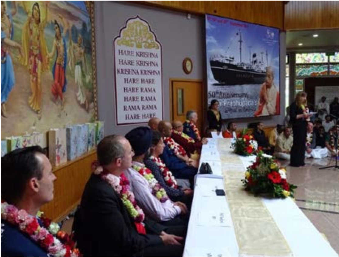
Dignitaries glorify Srila Prabhupada in Auckland, New Zealand

https://www.youtube.com/watch?v=QjNiW9to1aY https://www.youtube.com/watch?v=FtcA_ASWIPo https://www.youtube.com/watch?t=1&v=26mXlPyDs-8 https://www.youtube.com/watch?v=taQ8W5skfqq https://www.youtube.com/watch?v=ISq1FQAYttg https://www.youtube.com/watch?v=n0NQumAxdU