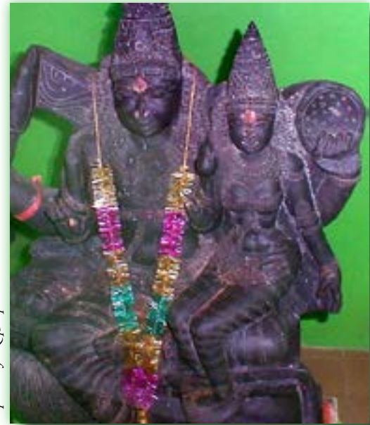
Budha (not to be confused with Buddha) and his consort Ila

On the other hand, giving great sages the power to make changes is one thing. Allowing scientists untrained in spiritual wisdom the same opportunity is likely a recipe for disaster. Even without genetic engineering, we have seen the desire for sons over daughters lead to infanticide and gender imbalance in China and rural India. Furthermore, the technology does not have a 100% success rate, leading to the possibility that embryos will be destroyed if they fail to meet certain specifications. Allowing our current social, political and scientific leaders the power to make such decisions seems dangerous. The real question here is not whether the technology should be used, but who should have the power to use it. Until we have a class of sages in our society, this is one tool we ought to leave on the shelf.