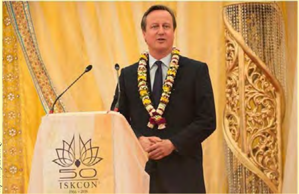
UK Prime Minister David Cameron at Bhaktivedanta Manor

The Prime Minister also congratulated ISKCON on its 50 th anniversary, joking that he too will celebrate his 50 th birthday this year. He went on to say: "I look at what you have done in the past fifty years and I think how much you can achieve in the next fifty. In fact, the next half century begins right now as we begin building the new Krishna Haveli, and I'm delighted to be putting the first tool in the ground."